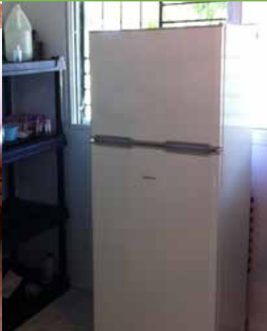
Brand-new propane powered refrigerator for the lab

We're making a lot of structural improvements to the clinic turning it into a fully-licensed Haitian hospital. Among these changes are: adding toilets to the radiology and lab areas, fire extinguishers, rebuilding showers and bathrooms, storage shelving, caulking and covering conduit in the Operation Rooms.