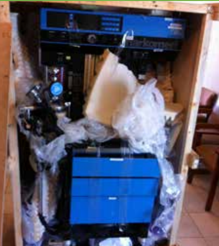
New-to-the-clinic anesthesia machine

Spreading the Gospel of Jesus Christ through a healthcare alliance with the people of Haiti.